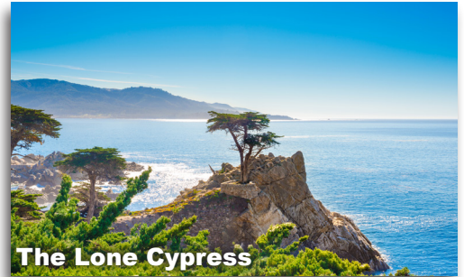
The Lone Cypress