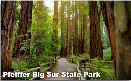
Pfeiffer Big Sur State Park