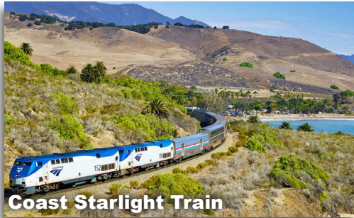
Coast Starlight Train